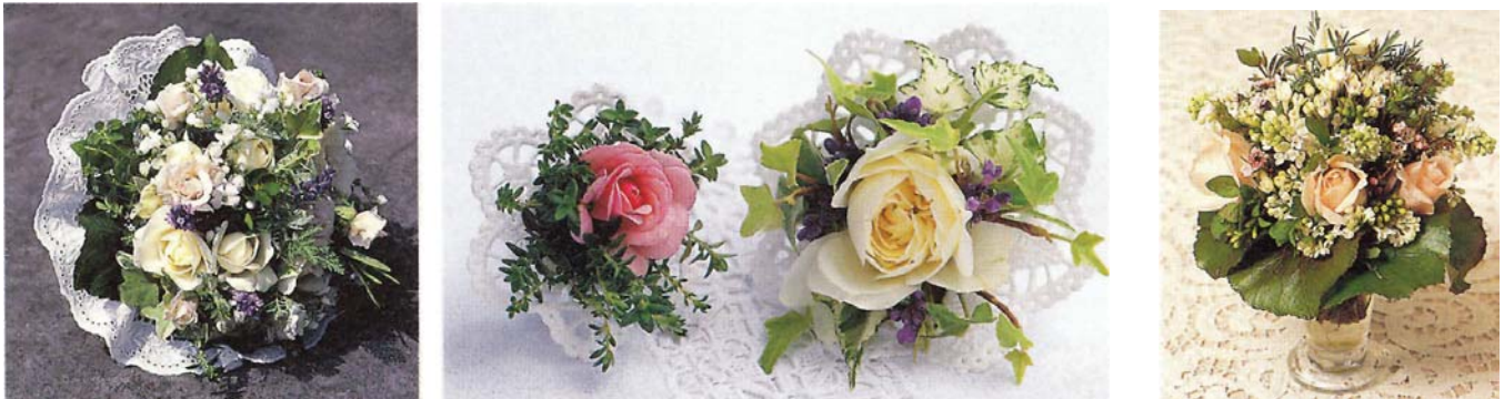
Left: Encircled by a pretty cotton lace collar, pale pink and cream roses, lavender and phlox blooms, a variety of herbs, variegated ivy, boxwood, and violet leaves form a delicate nosegay. Center: Two tiny paper Biedermeiers.. suitable for very young flower girls hold petite bunches of flowers and herbs. On the left, a single rose is encircled with thyme. On the right, a rose is ringed with lavender and ivy. Right: Used as a small bouquet to flank an arrangement on a dining room table, a Bridal White rose is surrounded with rosemary, bouvardia, white lilac, plum foliage, a ring of Lady Diana roses, and galax leaves.