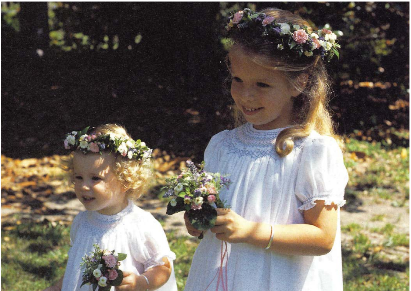
Two young flower girls with delicate bands of spring flowers in their hair hold tiny tussie-mussies as they excitedly await the bride's arrival.