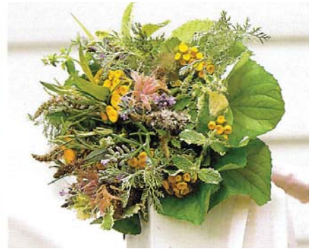
Left: A fragrant tussie-mussie in a paper Biedermeier includes feverfew, roses, hydrangeas, blue salvia, pineapple mint, ageratum, ivy, veronica, lavender, and rosemary surrounded with violet leaves. Center: A dried version of a tussie-mussie is a pleasant reminder of the special occasion for which it was created. Right: A delicate little nosegay of fresh spring herbs is outlined with violet leaves and tied with pink ribbons. Pansy blooms, Roman wormwood, rosemary, lemon verbena, lavender, wild bergamot, and pineapple mint accent the nosegay.